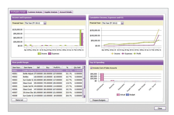
Quickly view your financial position